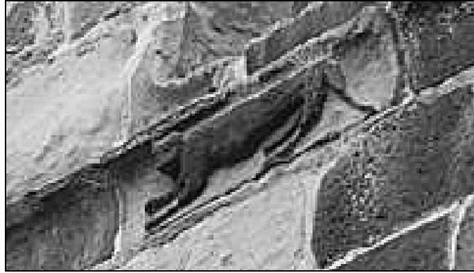
Grappenhall church cat carving, possibly Tudor era?

So the grinning Cheshire cat was well-known throughout England before Carroll. For some reason the breed had remained distinctive & localised enough for it to be remarked upon in print. It seems likely that this distinctive and remarkable Cheshire cat was what we now call the British Blue.